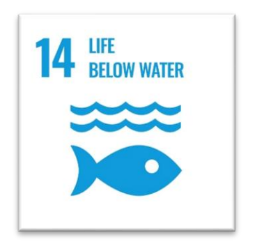
SDG 14: Life below water

Rivers, lakes and the sea are a source of transportation and power over which our cities were born and libraries can document well this richness. Access to information related to life below water may educate people in having a sustainable relation with their water environment.