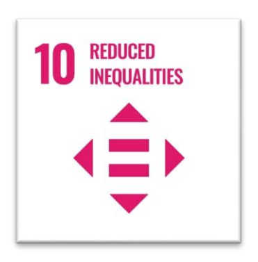
SDG 10: Reducing Inequality

Supporting individual development and integrating those who are socially excluded (from people below the poverty line to immigrants, from minorities to imprisoned people) are at the core of the library's work. Library efforts take advantage of their proximity to people living in socially sensitive areas or in difficult situations and provide them with access to media and culture, as well as exchange systems for books and other cultural products. In this respect, the implementation of library exceptions to the EU Copyright Directive approved in 2019 is a measure supporting the reduction of inequality in situations of market failure.