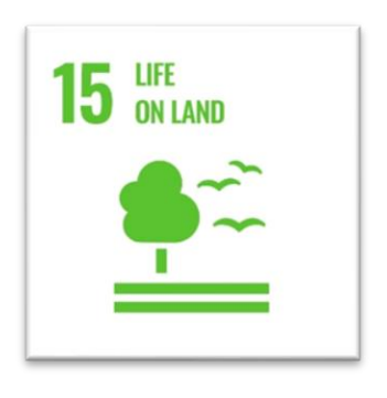
SDG 15: Life On Land

Activities in libraries on biodiversity should start with the promotion of the Convention on Biological Diversity dedicated to promoting sustainable development, which was signed by 150 government leaders at the 1992 Rio Earth Summit.