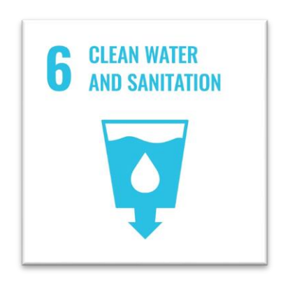
SDG 6: Clean Water and Sanitation

Also worth a mention is the network of libraries (and also museums) dedicated to the promotion of LGBT and gender equality, such as the International Homo/Lesbian Information Center and Archive (IHLIA) in the Public Library of Amsterdam and the Atria Institute on gender equality and women's history, also in Amsterdam, or the Centrum Schwule Geschichte in Cologne.