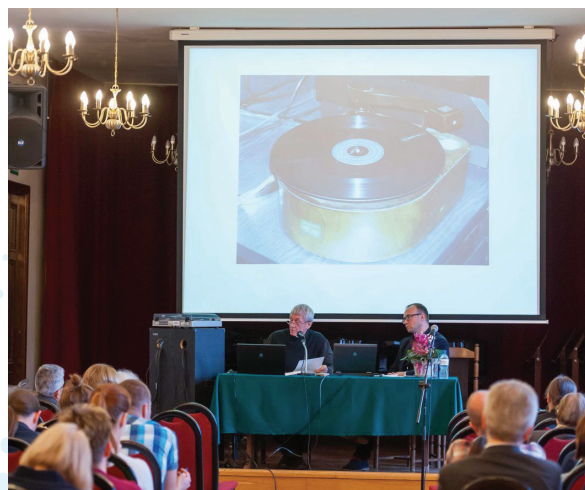
▲ Bydgoszcz 2013

The 8th National Sound Libraries Conference „Polish phonography since the Independence regaining till present days” was organised on May 13-14, 2019 in Gołuchów nearby Kalisz, in the former magnate mansion. Due to the title, historical topics dominated