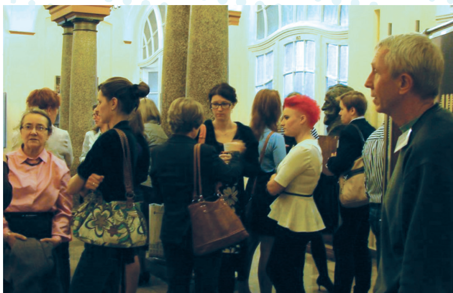
▼ Bydgoszcz 2013

Except for conferences, the Sound Libraries Section participated actively in many seminars, among others in 2018 it co-organised the research session „Phonography for music and science: history, relations, contemporariness”, organised on the occasion of the 140th anniversary of phonograph invention by T.A. Edison. During the meeting the following topics were discussed: influence of phonography on periodisation of the history of music, reception of a phonograph, recordings of folk music, its preservation and sharing.