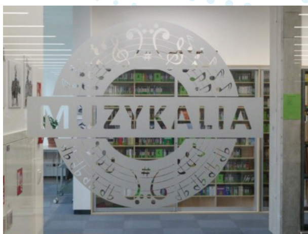
▲ Music Department of the Library of Adam Mickiewicz University, Poznań

The Section members, thanks to their contacts and information exchange, participation in discussion groups, trainings and conferences organised by the Section Board, have the opportunity to benefit from the experiences and solutions useful in their professional life, and to develop common statements concerning description, storage, and preservation of sound and audiovisual collections. The Section supports also their research activities – many of the members take part in the meetings, presenting results of their studies, as well as participating in other projects. The Section members' output is documented in conference proceedings.